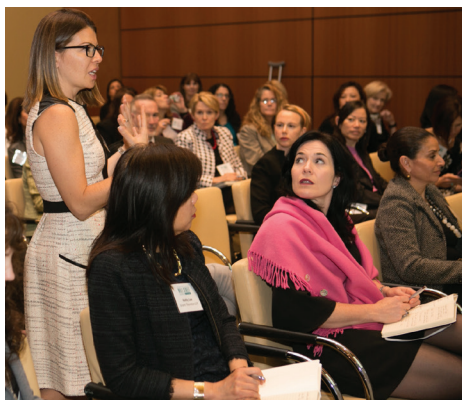
Photo Highlights of the 8th Annual Wall Street Women Forum